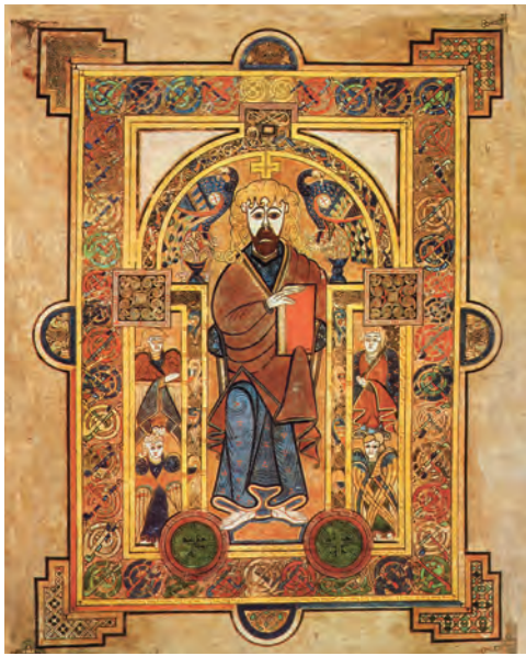
The Book of Kells , Trinity College, Dublin