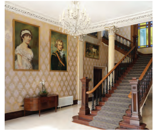
Lyrath Estate Hotel, Kilkenny

Ireland's most magical address has been welcoming guests since the 16th century. As the ancestral home of the O'Briens of Dromoland, this castle's lineage dates back 1,000 years to Brian Boru, one of the last High Kings of Ireland.