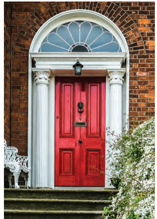
Photos clockwise from top right: Map of the region; Heywood Gardens, Ballinakill; Georgian door, Dublin; Dromoland Castle (interior), Newmarket-on-Fergus; Birr Castle, Birr, photo © Tourism Ireland, courtesy of Chris Hill; St. Patrick's Cathedral (interior), Dublin. Front cover: Powerscourt House & Gardens, Enniskerry, photo © Tourism Ireland, courtesy of Chris Hill. Back cover: The Long Room, Trinity College, Dublin, photo © Tourism Ireland (top); and Cliffs of Moher, Liscannor (bottom).