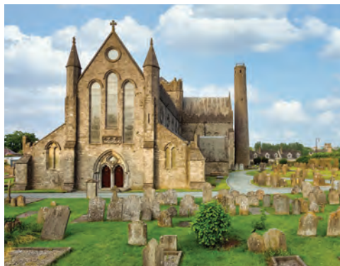
St. Canice's Cathedral, Kilkenny

Depart Dublin and travel south to the charming medieval town of Kilkenny. En route, in Russellstown, stop at Russborough House, which sits in the heart of the panoramic West Wicklow landscape, for a private tour. The plasterwork, furnishings, and landscaped gardens—including the delightful Lady's Island—make Russborough House one of the finest great houses in Ireland. Lunch will be at the Tulfarris Hotel, an 18th-century manor house set amid 200 acres on the banks of Blessington Lakes. In the village of Ballinakill, visit Heywood Gardens, a tranquil and romantic hillside escape with a vista that