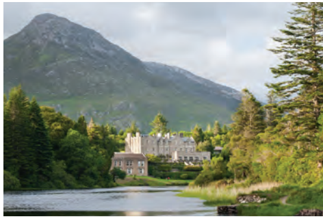
Ballynahinch Castle, Ballynahinch

© 2023 Arrangements Abroad Inc. All Rights Reserved.