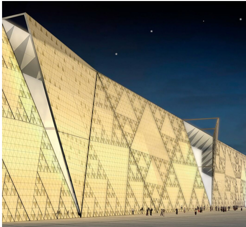
Grand Egyptian Museum (artist's rendering), Cairo