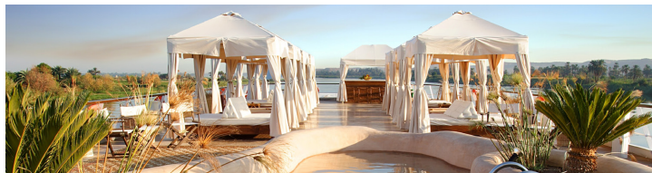
Sun Deck, Sanctuary Sun Boat III