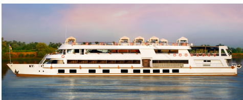
Sanctuary Sun Boat III

With just 17 cabins, the intimate Sanctuary Sun Boat III represents the ultimate in Nile cruises. This graceful river yacht features a sun deck with a swimming pool and private cabanas, a lounge, and a gourmet restaurant staffed by award-winning chefs. All cabins offer Nile River views. Sanctuary Sun Boat III has been repeatedly ranked among the most beautiful boats in the world by readers of Condé Nast Traveler .