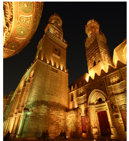
Ibn Tulun Mosque, Cairo