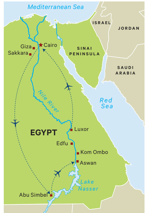
Photos clockwise from top right: Hieroglyphics, Kom Ombo; Temple of Karnak, Luxor; Map of the region; Great Pyramid and the Sphinx, Giza; Interior, Gayer-Anderson Museum, Cairo; Foot of a Statue Temple of Karnak, Luxor. Front cover: Detail of a column from the Temple of Philae. Back cover: Felucca on the Nile (top); and Step Pyramid of King Djoser, Sakkara (bottom).