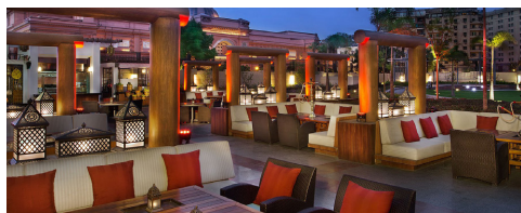
The Nile Ritz-Carlton, Cairo